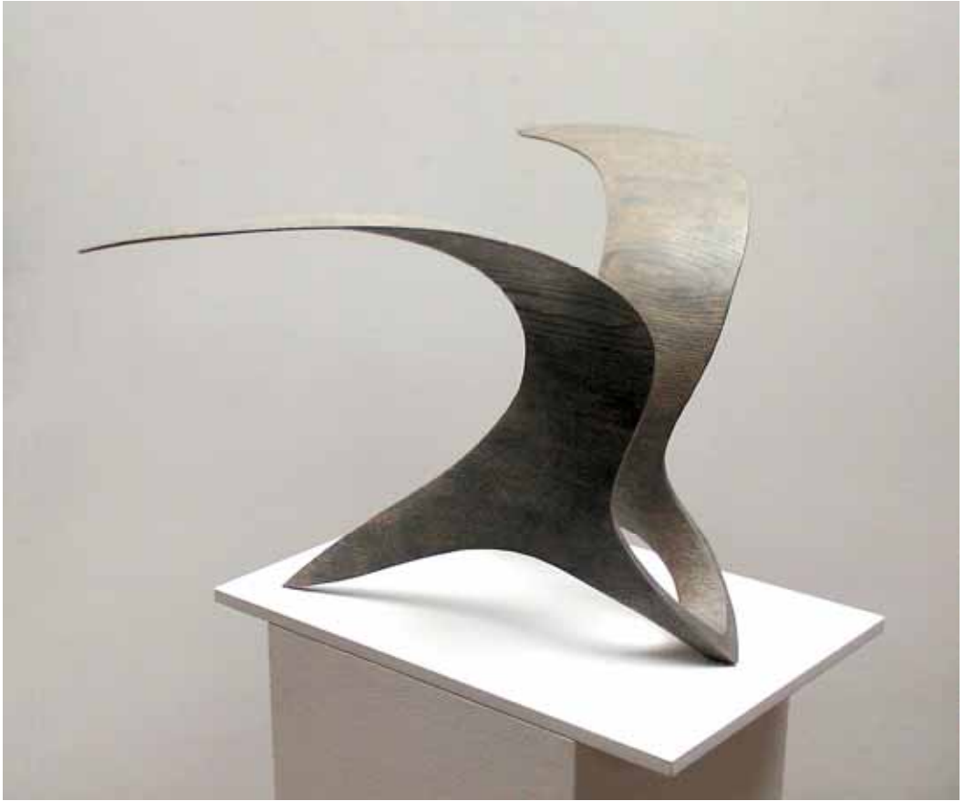
Garuda Eichenholz, gebrannt, lasierend bemalt Ölfarbe (Oak-Tree, surface fired, scumbling oil paint) 2013, 48 x 60 x 50 cm