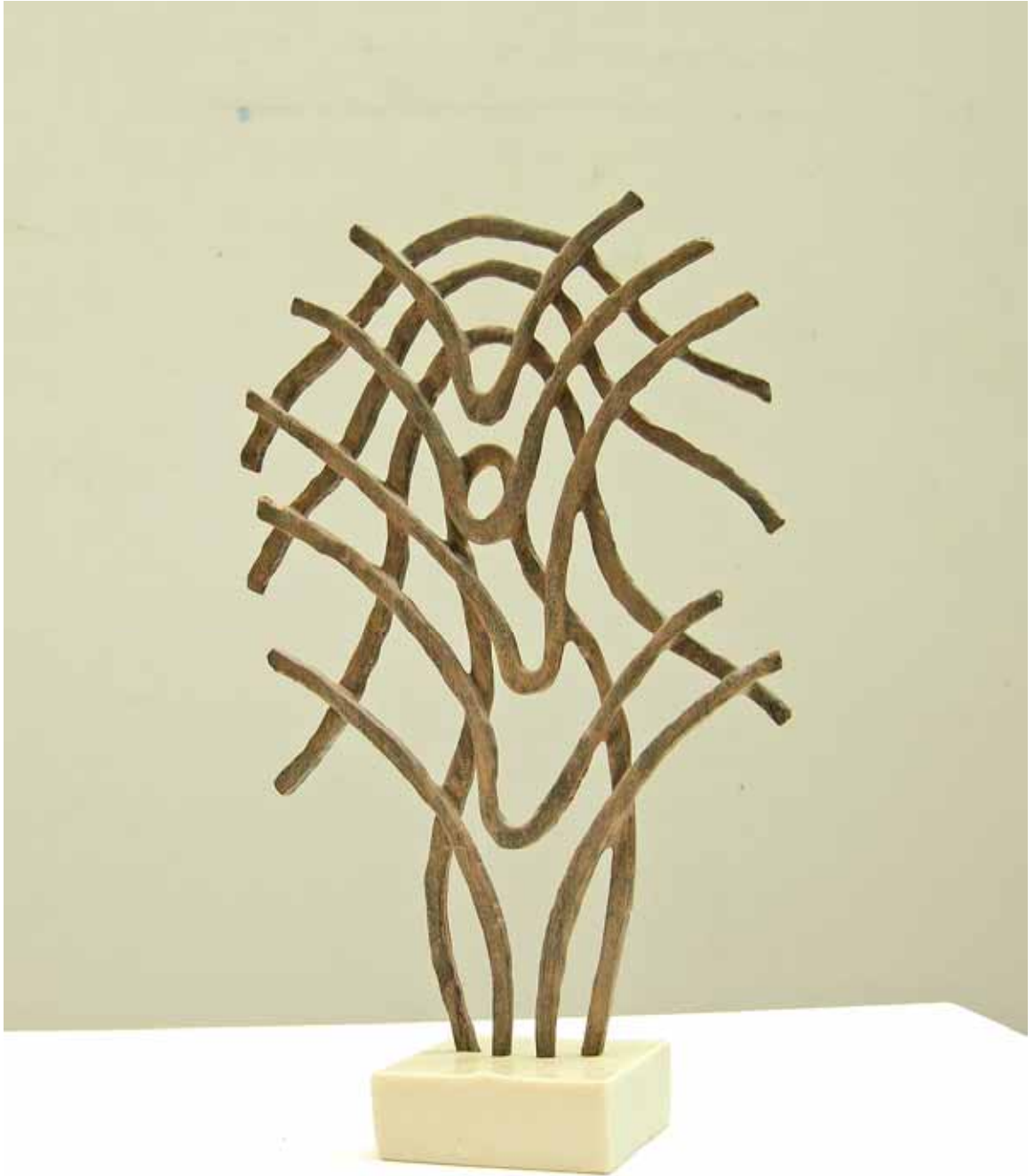
Vomfliegenwollen III (Want to Fly III) Ahorn, gebrannt, lasierend bemalt Ölfarbe (Maple-Tree, surface fired, scumbling oil paint) 2013, 15 x 6 x 25 cm