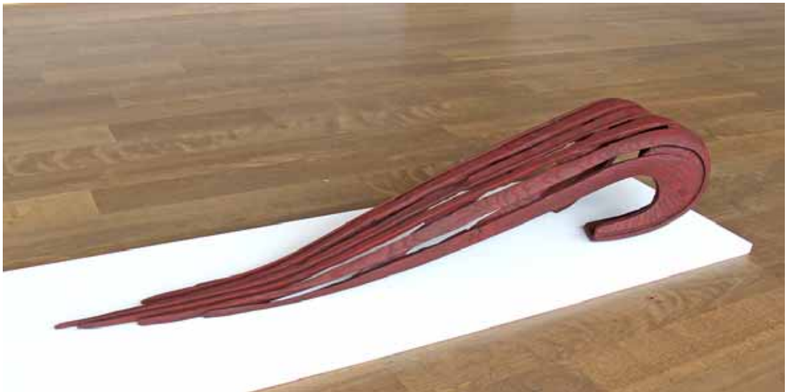
Adoration I / Adoration II Eschenholz, gebrannt, lasierend bemalt Ölfarbe (Ash-Tree, surface fired, scumbling oil paint) 2013, je 140 x 30 x 25 cm