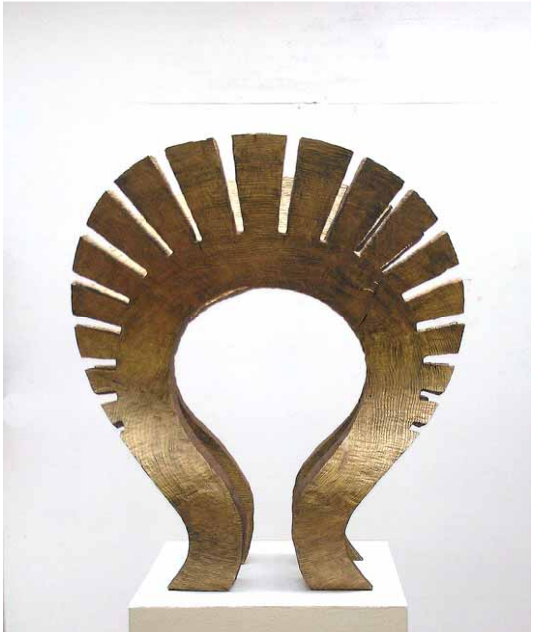
Die Krönung (The Coronation) Eichenholz, gebrannt, lasierend bemalt Ölfarbe (Oak-Tree, surface fired, scumbling oil paint) 2013, 55 x 23 x 68 cm