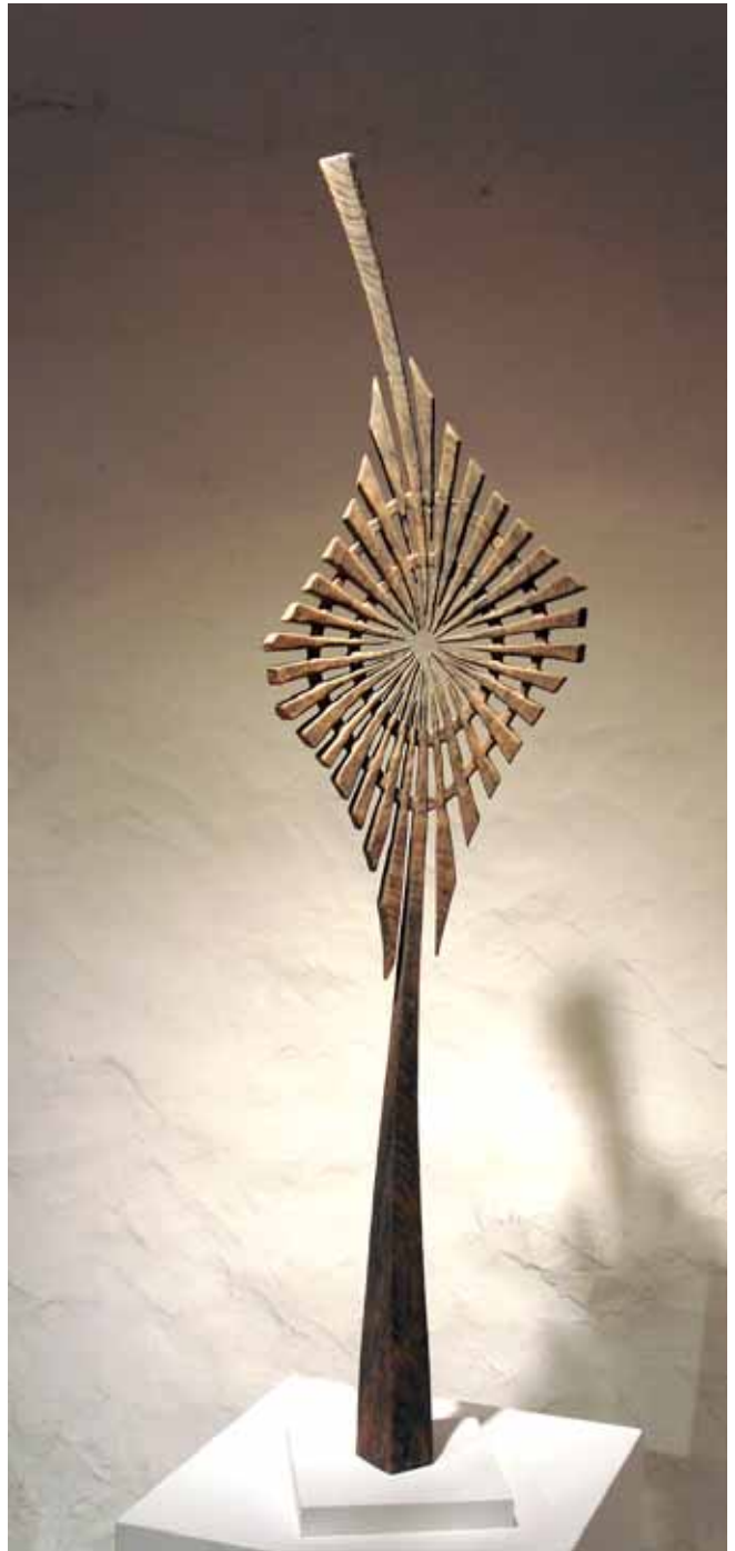
Liaise IX Eichenholz, gebrannt, lasierend bemalt Ölfarbe (Oak-Tree, surface fired, scumbling oil paint) 2013, 26 x 7 x 117 cm