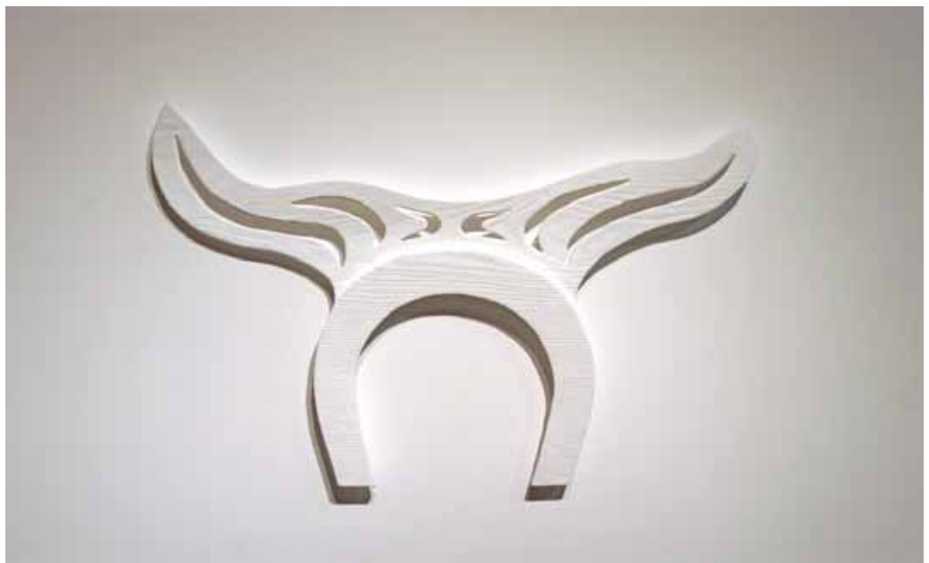
A Figure with Light I / A Figure with Light II Eschenholz, gebrannt, lasierend bemalt Ölfarbe (Ash-Tree, surface fired, scumbling oil paint) 2013, 45 x 4 x 55 cm / 85 x 4 x 55